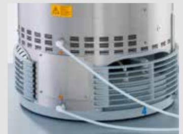
Controlled exhaust air routing