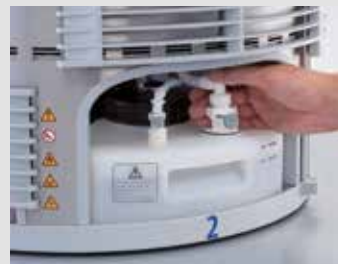
Connecting media containers