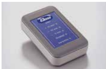
Pager, portable signalling device, indicates when the set programme is finished

The new standard for the use of flammable solvents in industrial production and assembly