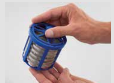
Removing cleaned and dried baskets