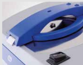
Vacuum is established