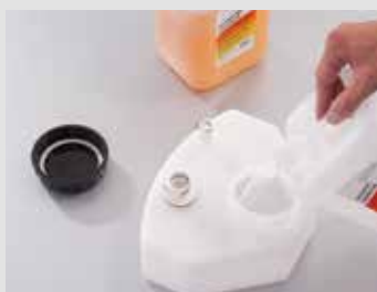
Filling cleaning and rinsing solution