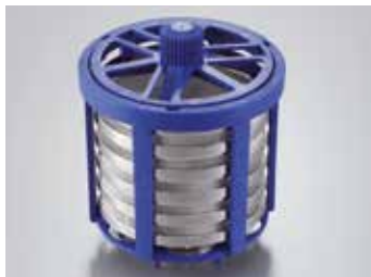
Basket holder with baskets