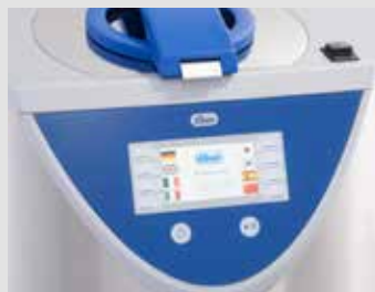
Selecting and starting program