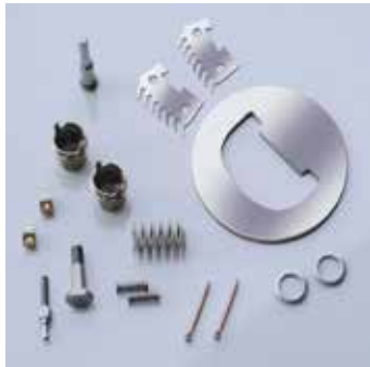
Micromechanics Precision parts

Single-chamber ultrasonic vacuum technology for cleaning with solvents. TÜV-certified safety due to intrinsic Ex-protection.