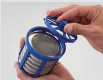
Filling baskets with watch parts

Elmasolvex VA has its own self-contained intrinsic Ex-protection due to the vacuum technology used and all the measures required by TÜV and the applicable technical regulations for explosion safety. This means that the explosion protection measures integrated in the machine already rule out any fire hazard in the primary zone, operation in compliance with the manual provided. The use of ultrasound is thus legally possible and permitted. The TÜV test performed confirms the requirements for the use of the prescribed CE mark.