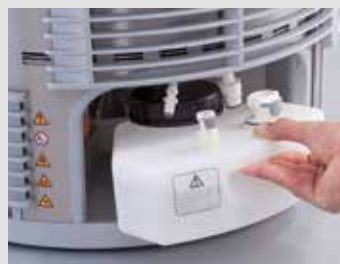
Installing media containers